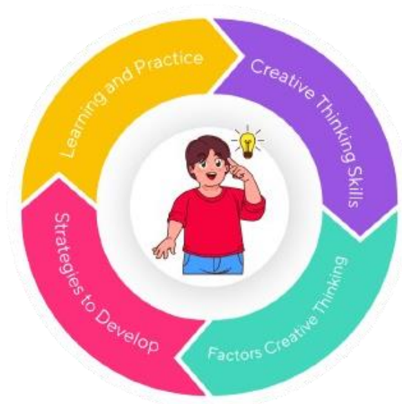
Figure 1. Developing Creative Thinking in Preschool Children Navigation Diagram

This research aims to bridge existing gaps in the literature and provide a comprehensive overview of creative thinking skills in preschool children. Additionally, this article offers detailed insights into the definition of creative thinking skills, the factors influencing creative thinking, and strategies for nurturing creative thinking skills. These findings guide teachers, schools, and parents and assist educational practitioners in cultivating and encouraging creative thinking skills in preschool children.